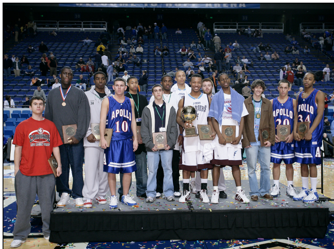
2006 Boys' Sweet 16® All-Tournament Team